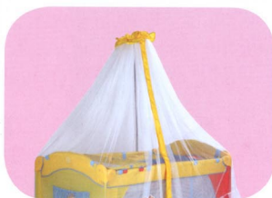
Hanging mosquito net